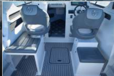
STORM GREY OVER BLACK STRAIGHT LINES