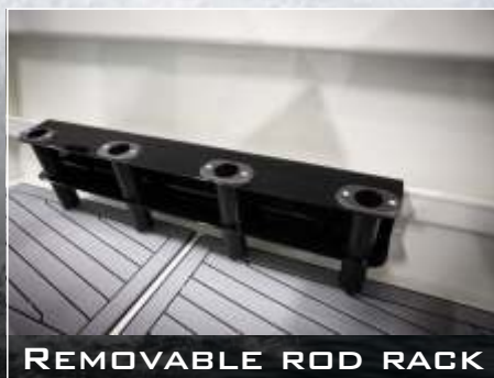
REMOVABLE ROD RACK