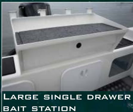
LARGE SINGLE DRAWER BAIT STATION