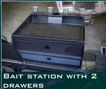
BAIT STATION WITH 2 DRAWERS