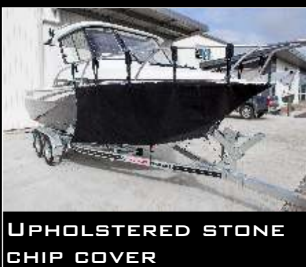
UPHOLSTERED STONE CHIP COVER