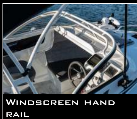
WINDSCREEN HAND RAIL