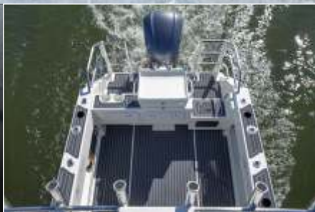
DARK GREY OVER STORM GREY STRAIGHT LINES