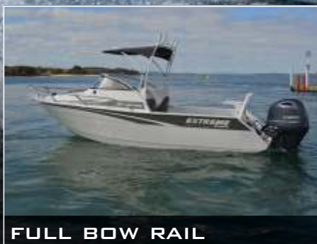
FULL BOW RAIL