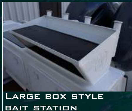
LARGE BOX STYLE BAIT STATION