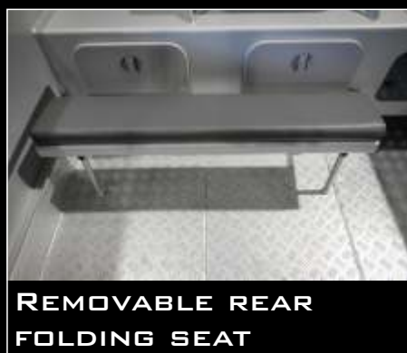
REMOVABLE REAR FOLDING SEAT