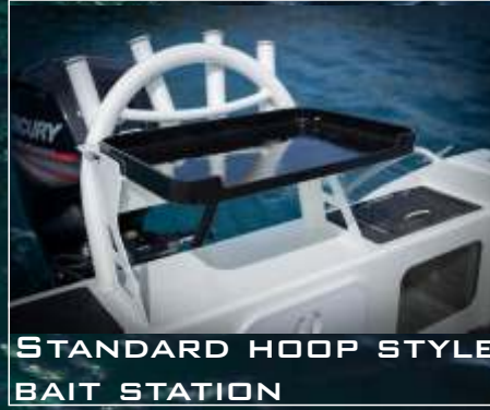
STANDARD HOOP STYLE BAIT STATION