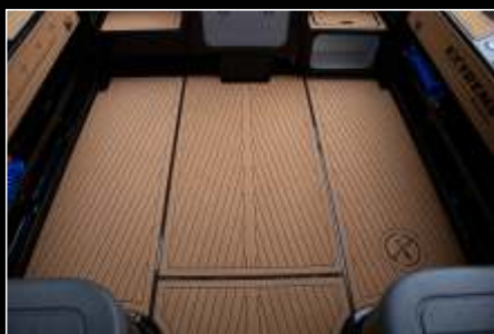
MOCHA OVER BLACK KING PLANK