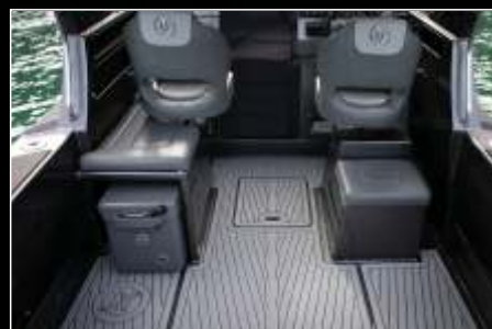
STORM GREY OVER BLACK KING PLANK