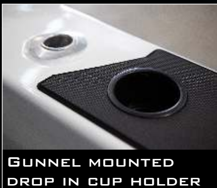
GUNNEL MOUNTED DROP IN CUP HOLDER