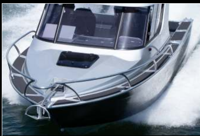
COMPLETE TOPSIDES SEADEK KIT