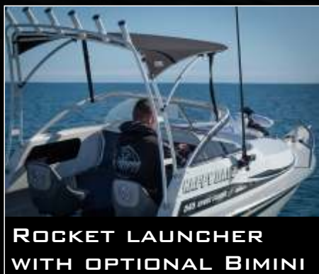
ROCKET LAUNCHER WITH OPTIONAL BIMINI