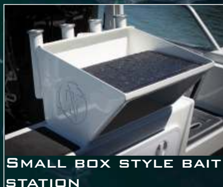
SMALL BOX STYLE BAIT STATION