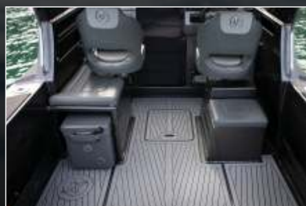
STORM GREY OVER BLACK KING PLANK