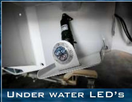
UNDER WATER LED'S