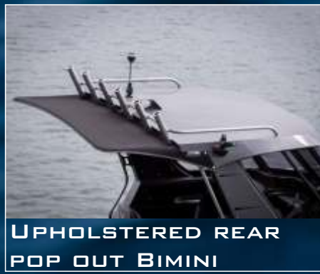
UPHOLSTERED REAR POP OUT BIMINI