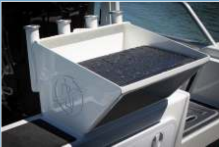
SMALL BOX STYLE BAIT STATION