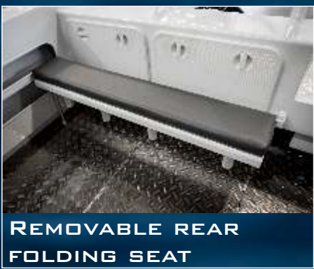
REMOVABLE REAR FOLDING SEAT