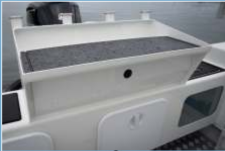
LARGE SINGLE DRAWER BAIT STATION