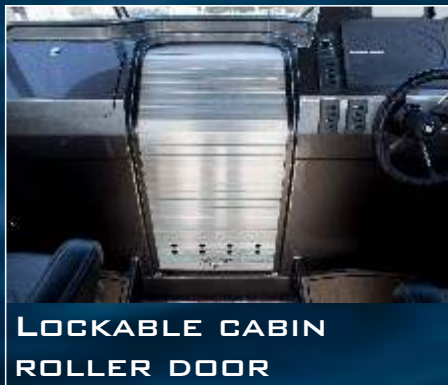
LOCKABLE CABIN ROLLER DOOR