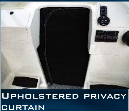
UPHOLSTERED PRIVACY CURTAIN