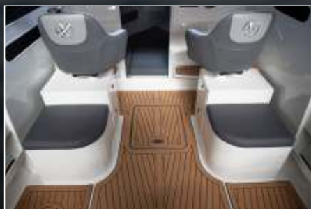
MOCHA OVER BLACK KING PLANK