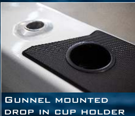
GUNNEL MOUNTED DROP IN CUP HOLDER