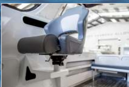
COUNTER LEVER BASE WITH BOLSTERED SEAT