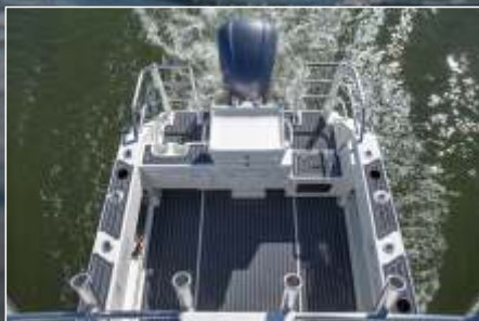
DARK GREY OVER STORM GREY STRAIGHT LINES