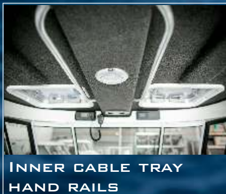
INNER CABLE TRAY HAND RAILS