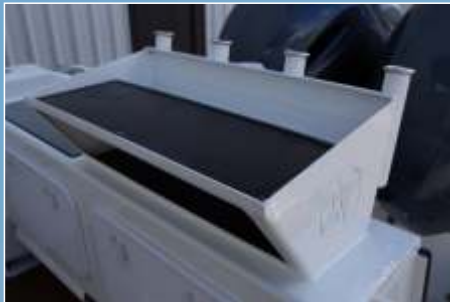
LARGE BOX STYLE BAIT STATION