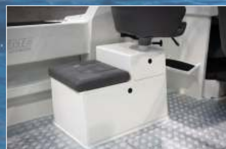
KING/QUEEN MODULE WITH 2 X DRAWERS