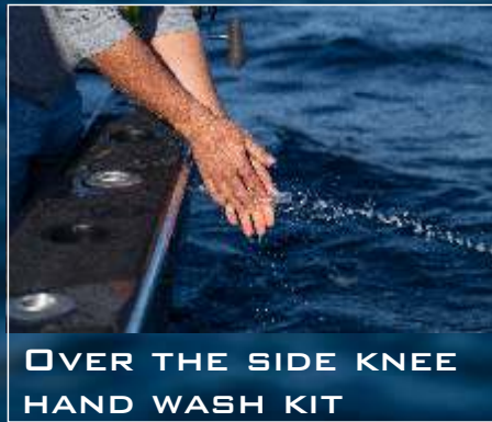
OVER THE SIDE KNEE HAND WASH KIT