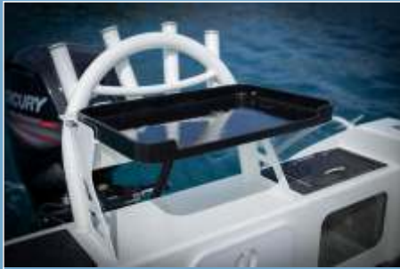
STANDARD HOOP STYLE BAIT STATION