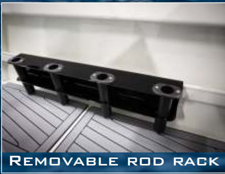
REMOVABLE ROD RACK