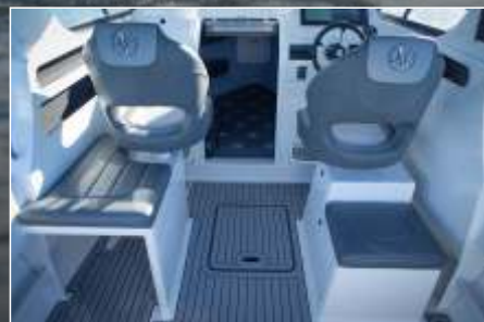
STORM GREY OVER BLACK STRAIGHT LINES