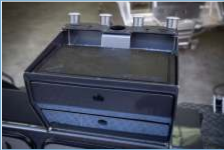
BAIT STATION WITH 2 DRAWERS