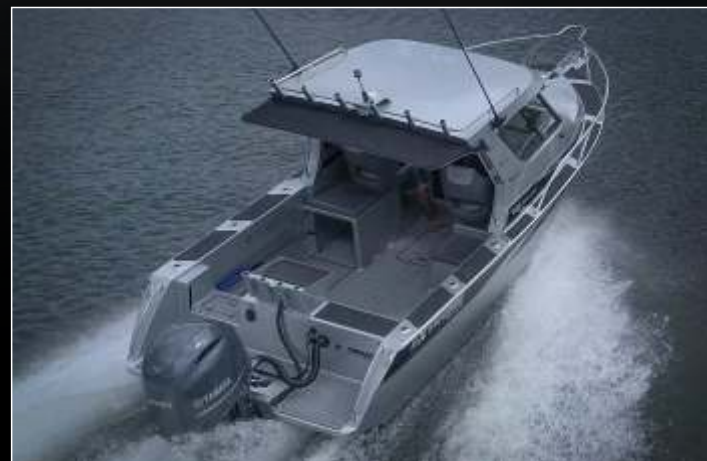
FULL UPPERTOPSIDES SEADEK KIT