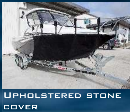
UPHOLSTERED STONE COVER