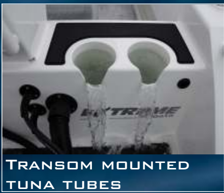
TRANSOM MOUNTED TUNA TUBES