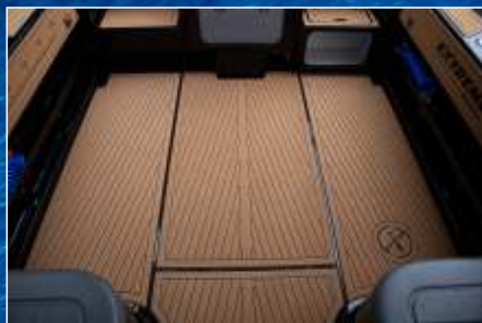
MOCHA OVER BLACK KING PLANK