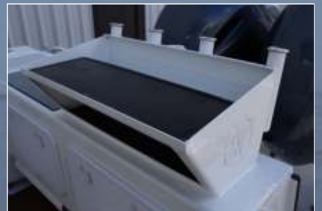
LARGE BOX STYLE BAIT STATION