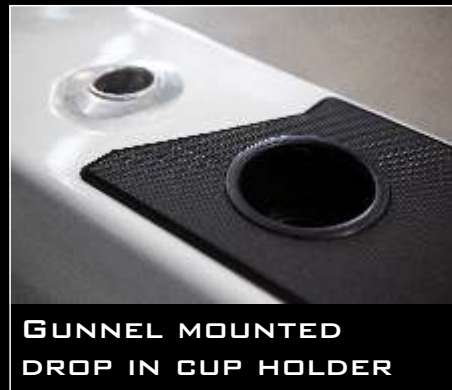
GUNNEL MOUNTED DROP IN CUP HOLDER