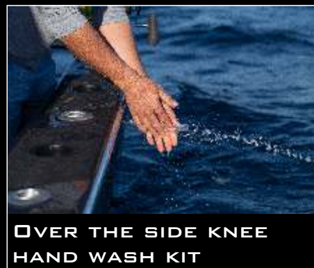
OVER THE SIDE KNEE HAND WASH KIT