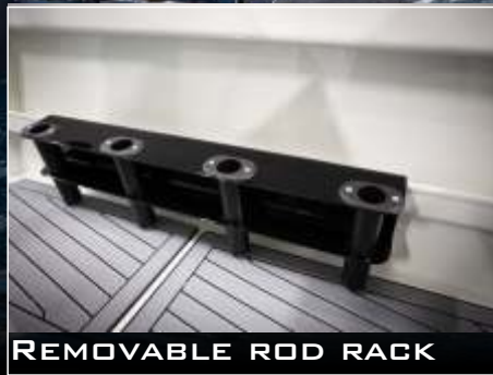
REMOVABLE ROD RACK