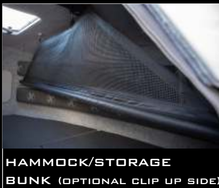
HAMMOCK/STORAGE BUNK (OPTIONAL CLIP UP SIDE)