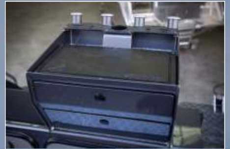
BAIT STATION WITH 2 DRAWERS