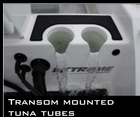
TRANSOM MOUNTED TUNA TUBES