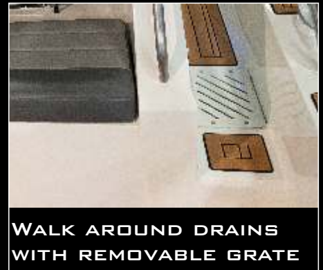
WALK AROUND DRAINS WITH REMOVABLE GRATE