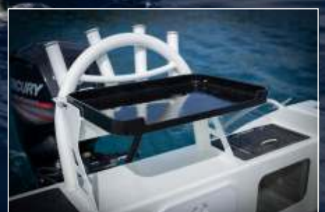
STANDARD HOOP STYLE BAIT STATION