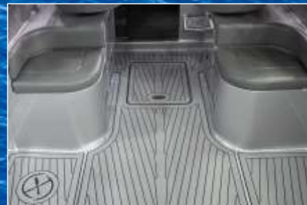
STORM GREY OVER BLACK KING PLANK