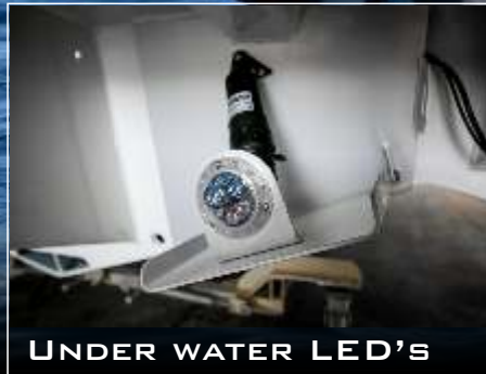
UNDER WATER LED'S