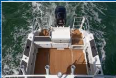
MOCHA OVER BLACK STRAIGHT LINES