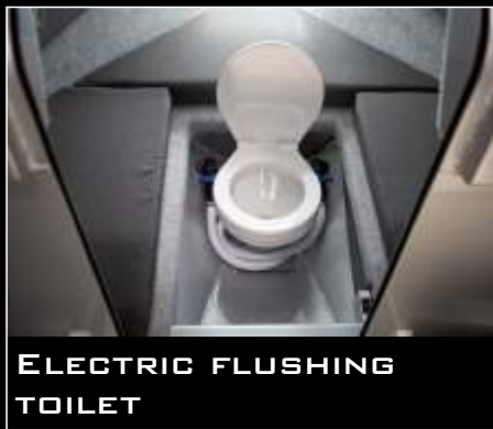
ELECTRIC FLUSHING TOILET