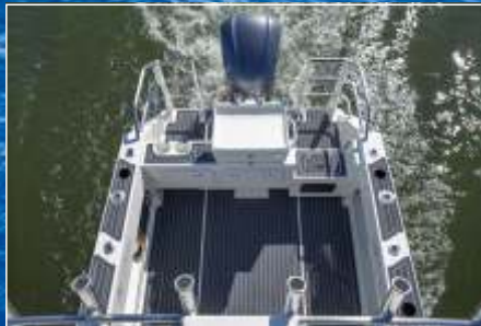
DARK GREY OVER STORM GREY STRAIGHT LINES