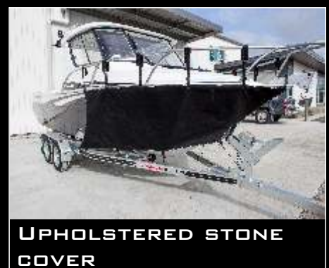
UPHOLSTERED STONE COVER