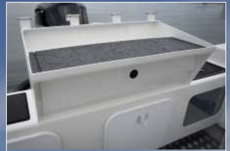
LARGE SINGLE DRAWER BAIT STATION