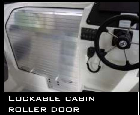
LOCKABLE CABIN ROLLER DOOR