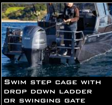
SWIM STEP CAGE WITH DROP DOWN LADDER OR SWINGING GATE