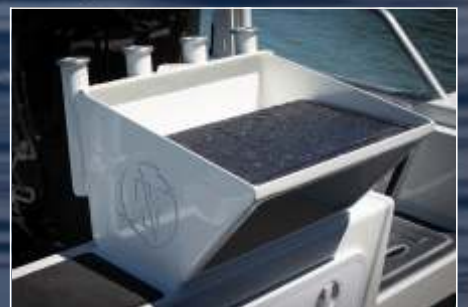
SMALL BOX STYLE BAIT STATION