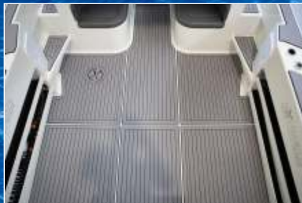
STORM GREY OVER BLACK STRAIGHT LINES