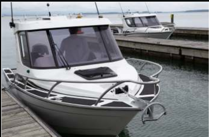
COMPLETE TOPSIDES SEADEK KIT