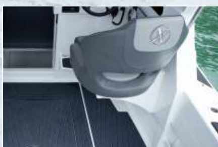
COUNTER LEVER BASE WITH BOLSTERED SEAT