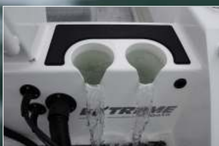
TRANSOM MOUNTED TUNA TUBES