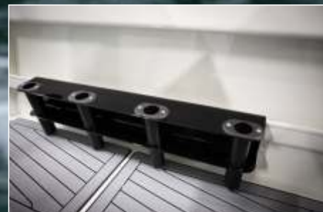
REMOVABLE ROD RACK