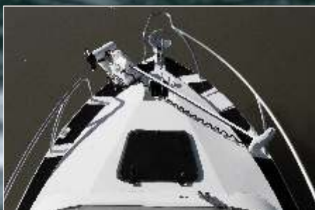
BOW RAIL MODIFICATION FOR MINNKOTA