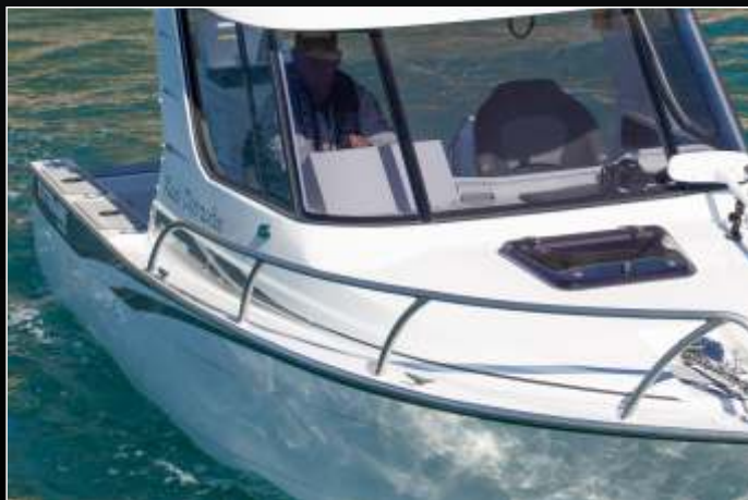
REAR TOPSIDES SEADEK KIT