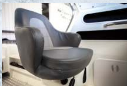
COUNTER LEVER BASE WITH STANDARD SEAT