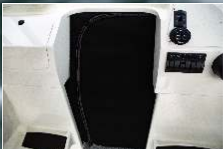
UPHOLSTERED PRIVACY CURTAIN