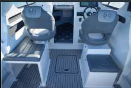
STORM GREY OVER BLACK STRAIGHT LINES