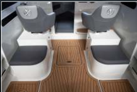
MOCHA OVER BLACK KING PLANK