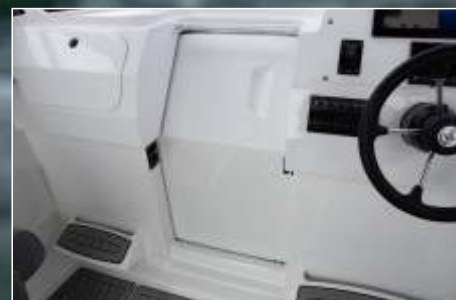
LOCKABLE SLIDING CABIN DOOR