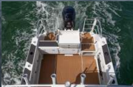
MOCHA OVER BLACK STRAIGHT LINES