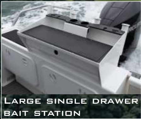
LARGE SINGLE DRAWER BAIT STATION