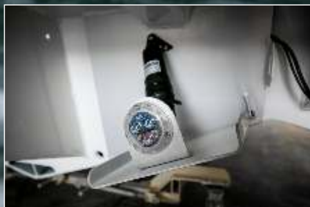
UNDER WATER LED'S