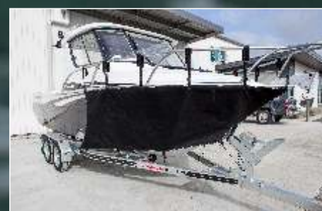
UPHOLSTERED STONE COVER