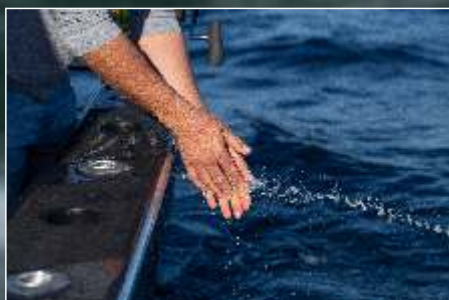
OVER THE SIDE KNEE/ HAND WASH KIT