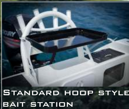
STANDARD HOOP STYLE BAIT STATION