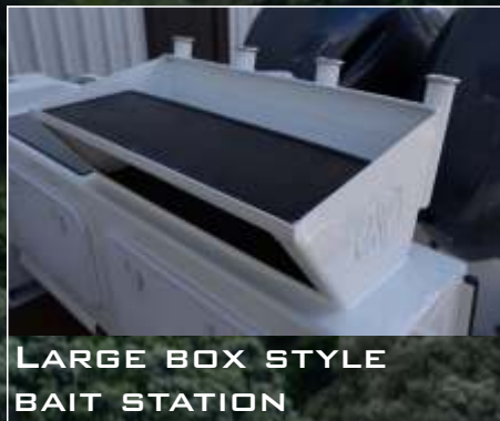
LARGE BOX STYLE BAIT STATION