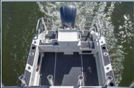
DARK GREY OVER STORM GREY STRAIGHT LINES