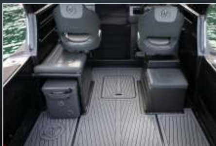
STORM GREY OVER BLACK KING PLANK