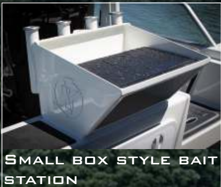
SMALL BOX STYLE BAIT STATION