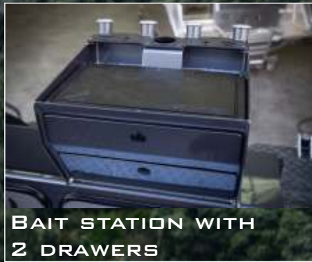
BAIT STATION WITH 2 DRAWERS