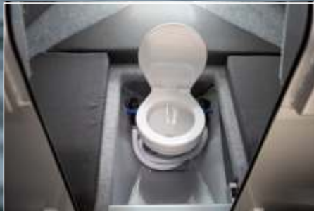
ELECTRIC FLUSHING TOILET