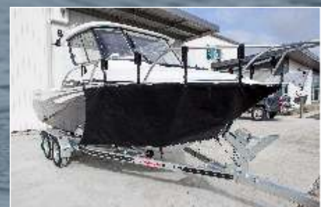
UPHOLSTERED STONE COVER