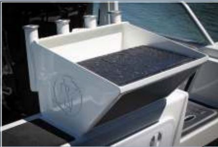
SMALL BOX STYLE BAIT STATION