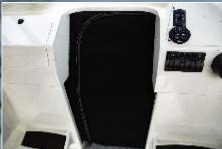
UPHOLSTERED PRIVACY CURTAIN