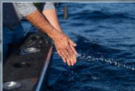
OVER THE SIDE KNEE/ HAND WASH KIT