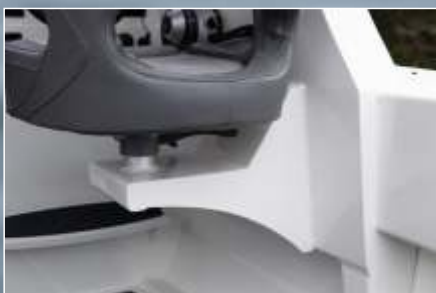
COUNTER LEVER BASE WITH BOLSTERED SEAT