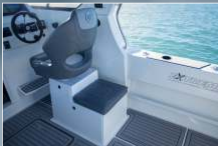
KING/QUEEN MODULE WITH 2 X DRAWERS