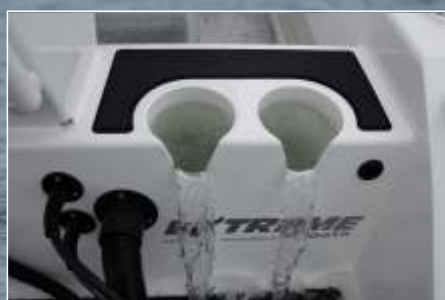
TRANSOM MOUNTED TUNA TUBES