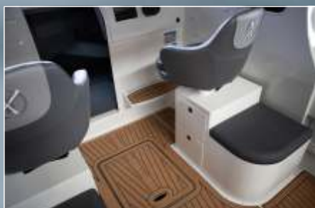
STAND ALONE CURVED MODULE WITH 2 X DRAWERS