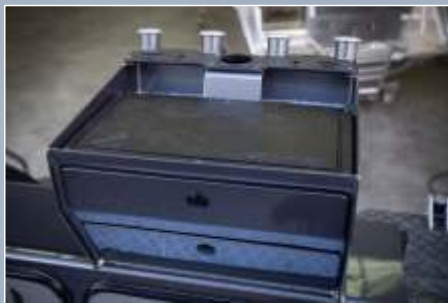
BAIT STATION WITH 2 DRAWERS