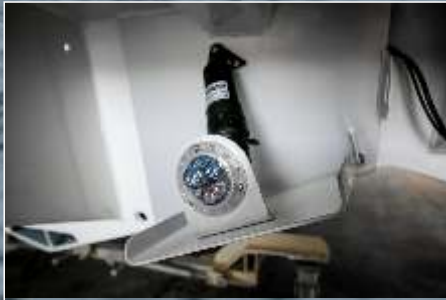
UNDER WATER LED'S