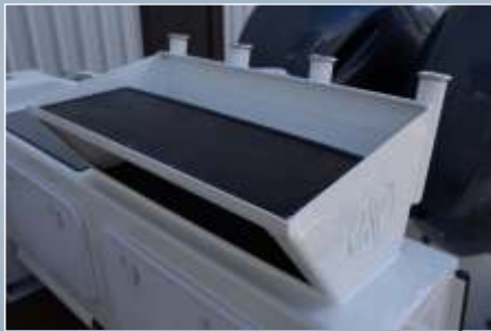
LARGE BOX STYLE BAIT STATION