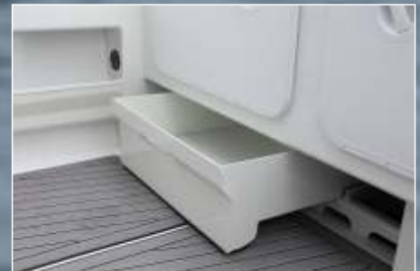
SLIDE OUT DRAWER BELOW TRANSOM