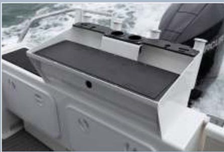
LARGE SINGLE DRAWER BAIT STATION