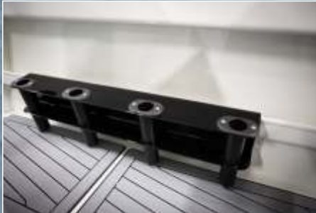
REMOVABLE ROD RACK