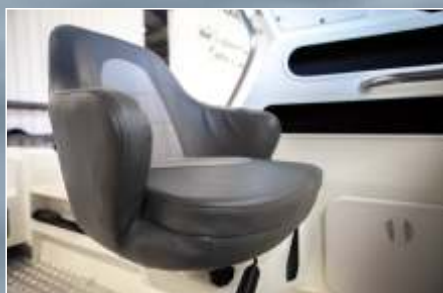
STANDARD SEAT ON COUNTER LEVER BASE