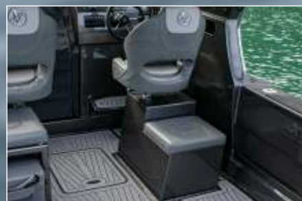
KING/QUEEN MODULE TOP ENTRY STORAGE