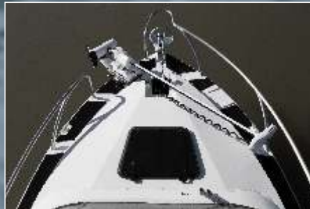
BOW RAIL MODIFICATION FOR MINNKOTA