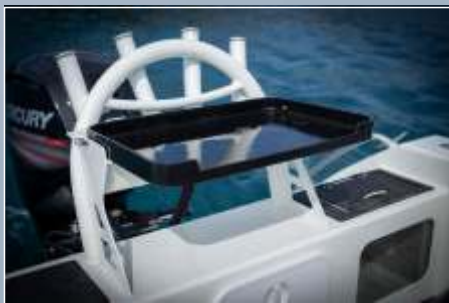
STANDARD HOOP STYLE BAIT STATION