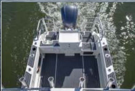
DARK GREY OVER STORM GREY STRAIGHT LINES